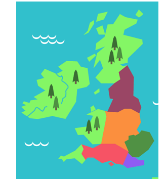
Each Anglo Saxon tribe took over a part of Britain and each kingdom had a leader.